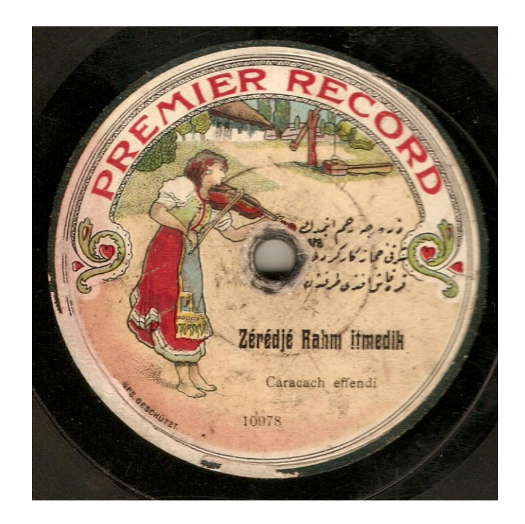
Fig 1: Premier Record 10978 by Karakaş Efendi

One of the records in my predominantly Greek and Turkish 78rpm record collection which had always intrigued me was a Turkish Premier Record . It really stood out among the many other labels which I had come across over the years. A beautiful, colourful label, depicting a violin-playing village girl. In the background a thatched cottage and one of those draw-wells, which are so typical of the Hungarian countryside. [see Fig. 1]