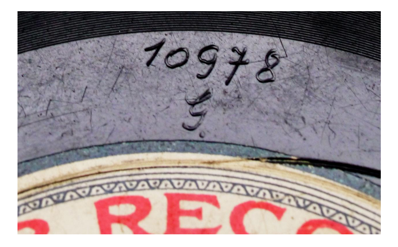
Figuur 4: Detail of Premier Record 10978 showing Antal Greiner's initial

According to my Hungarian dragoman it says that Antal Greiner has made 120 Turkish recordings for the First Hungarian Record Factory and that some 100.000 copies were pressed<sup>15</sup>. As we will see later, Antal Greiner made in fact 122 Turkish recordings. Having learned that Antal Greiner was the recording engineer, it can be safely assumed that the 'G.' in the wax of recording 10978 stands for 'Greiner' . (see Fig. 4)