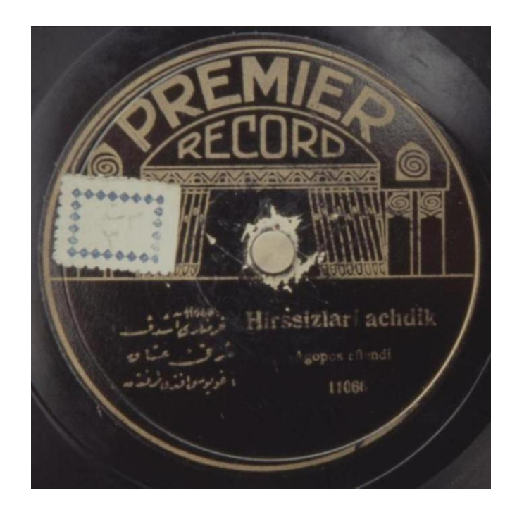
Fig 2: Premier Record 11066 by Agopos Efendi

Instead of the 'romantic' colourful village girl label, we have a black label with a stylized image in gold of a theatre stage, with curtains at both sides, in Jugendstil fashion.<sup>1</sup> Which obscure record company had produced these Turkish Premier Records?